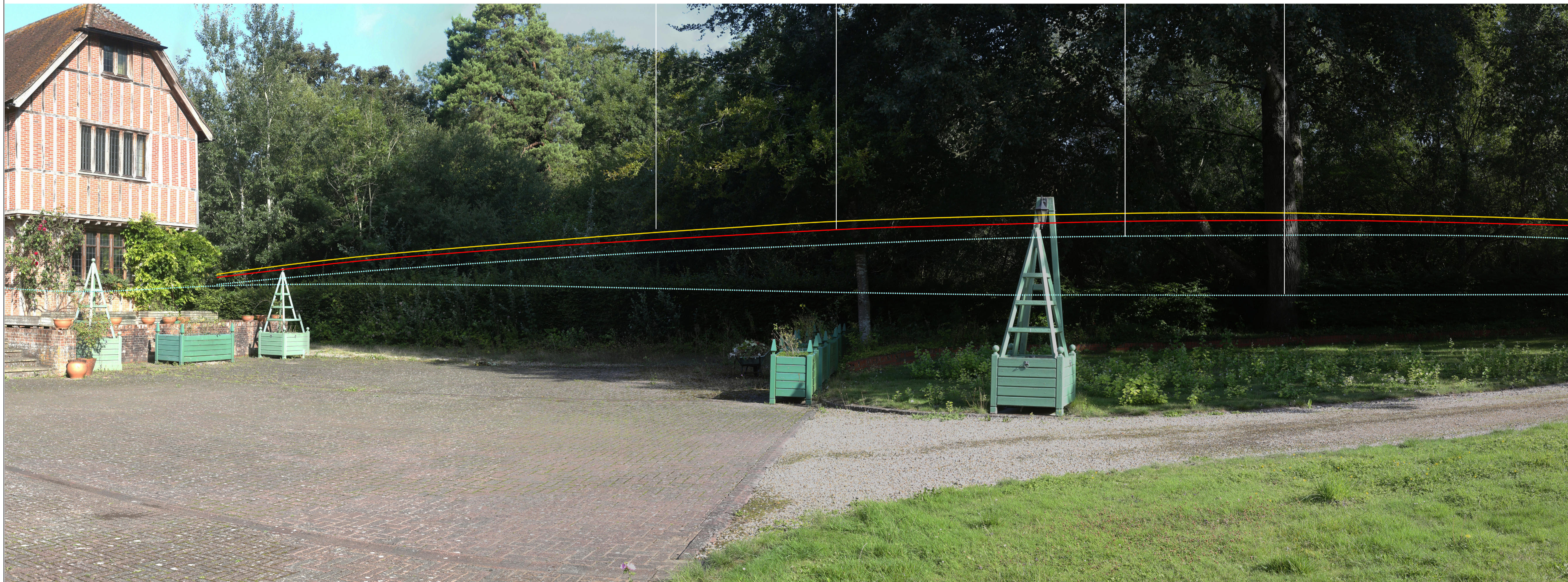
PROPOSED (SUMMER YEAR 15)

Lower blue dotted line indicates road level of slip road